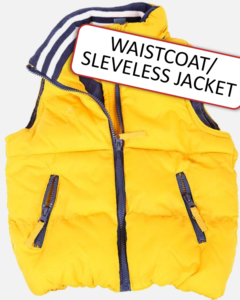
WAISTCOAT/ SLEEVELESS JACKET